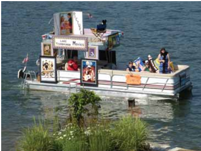
Lake Tishomingo Movies, Schaab, second place.