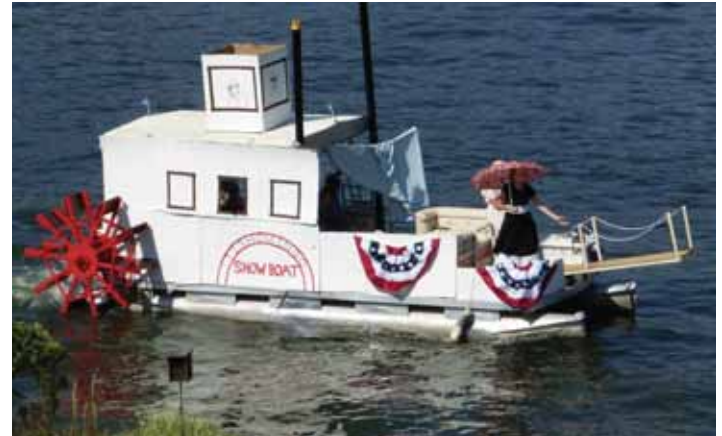
Showboat, Hejnal, third place.

Additional photos can be viewed at the website: