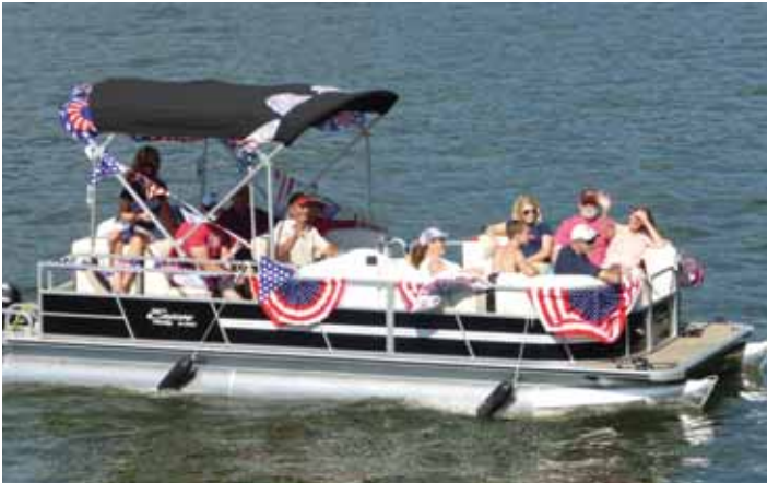
Boat parade participants.

PRSR STD US POSTAGE PAID HILLSBORO MO PERMIT NO. 9