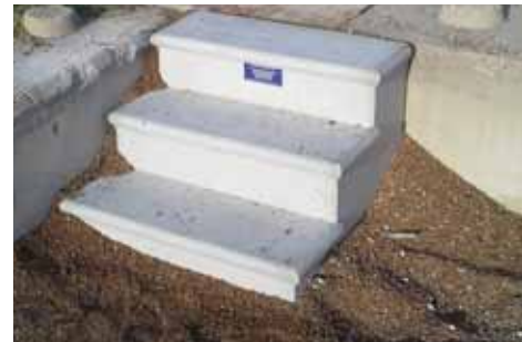
New steps installed at the swim beach area.