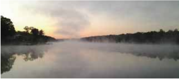
Sunrise, August 18.

PRSR STD US POSTAGE PAID HILLSBORO MO PERMIT NO. 9