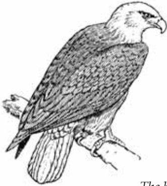
The bald eagle has returned to the lake.

PRSR STD US POSTAGE PAID HILLSBORO MO PERMIT NO. 9