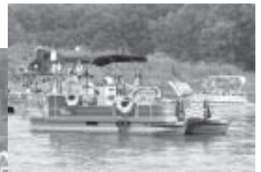
"Uncle Sam" - Evans, K70