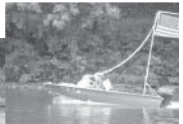
"American Flag" Runabout First Place, Blaha, A16