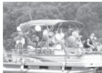
"Sponge Bob" - Ott, I6