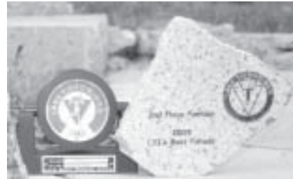
Trophies awarded for the boat parade.