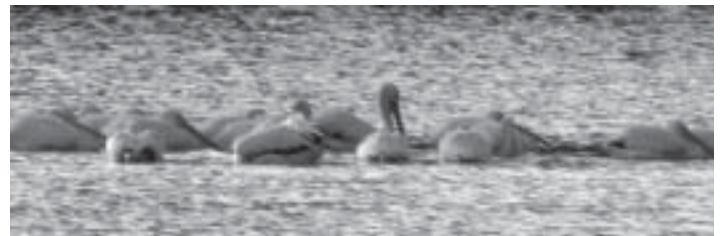
Friday morning near the dam.

A flock of approximately 30 white pelicans visited the lake Thursday evening, June 23. They stayed the night and left the next day.