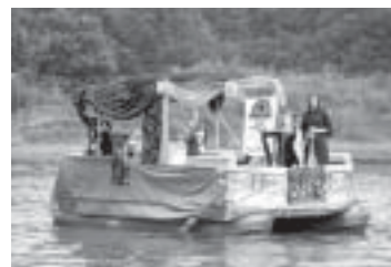
"Star Wars" - Deutsch, D32