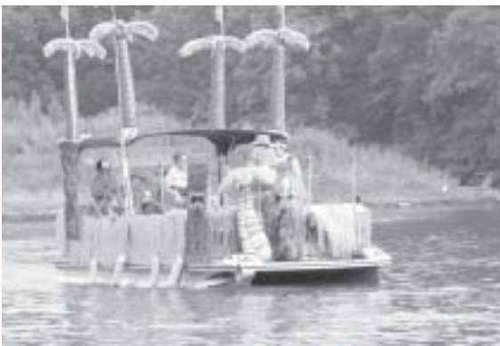
Left: "Aloha" Pontoon Second Place, Blaha, A16