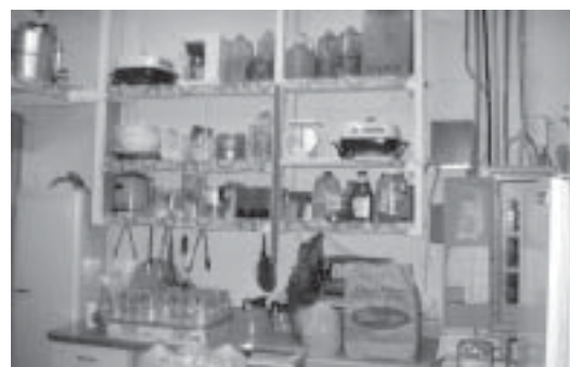
North wall of Community House kitchen.