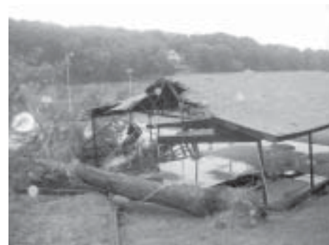
July 25, 2004, morning after wind damage.