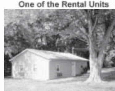
One of the Rental Units

7754 Hillsboro House Springs Rd. Big Home w/Inlaw Qtrs. & 3 Rental Homes Investment Income on Over 2 Acres