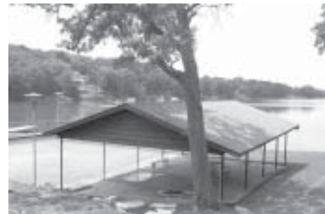
June 2003, with brand new roof shingles.