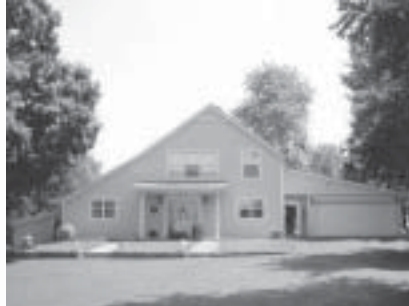
Front of Main Hse.

Main home has been beautifully redone with Berber carpet, whirlpool tub, formal dining rm. & many other extras. All other units completely rehabbed & rented. Income of over $30,000 per year!