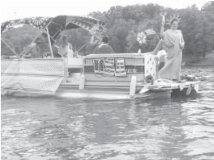
Second Place -- Blaha, A-16, "Lady Liberty." Not shown: tied for Third Place -- Farwig, "Takin' a Bath" and Dierzbicki "Sports."