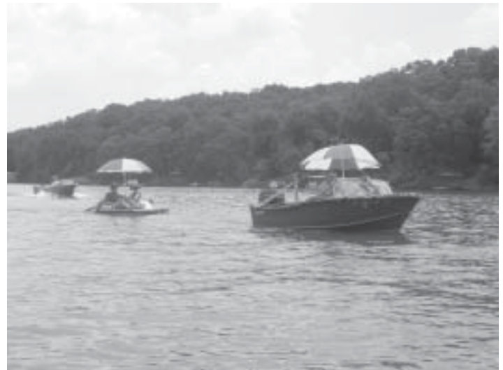
Second Place -- Blaha, A-16, "Patriotic"

Thank you to everyone who participated in the boat parade.