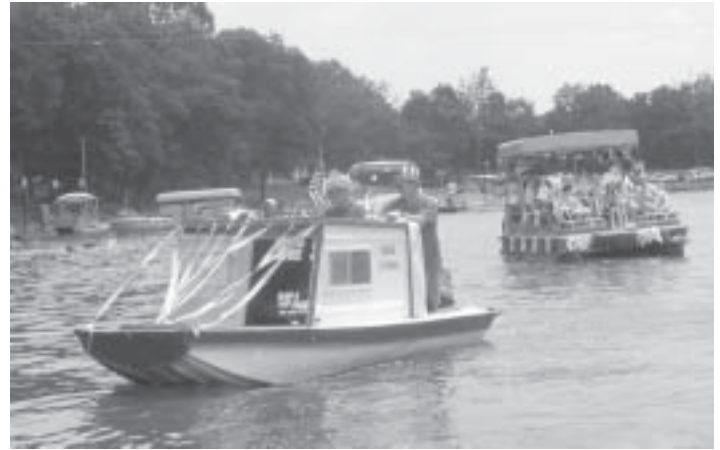
The parade began at 1pm. The lead boat was the Lake Patrol piloted by Ed Melchior.