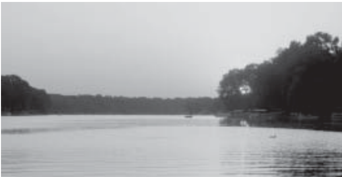
Beautiful Tishomingo sunset, from the Community House July 3.