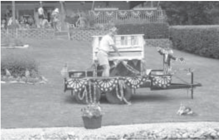
A patriotic song for the boat parade.