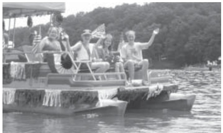
Miss Tishomingo and her court in the boat parade.