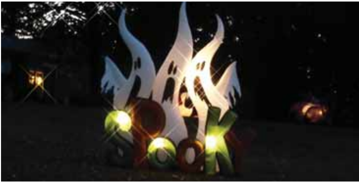
Scary characters recently seen on South Lakeshore Dr.

If you observe anyone operating an ATV on private lots or off-road lake property you can report the trespassing to the Jefferson County Sheriff: (636) 797-5000.