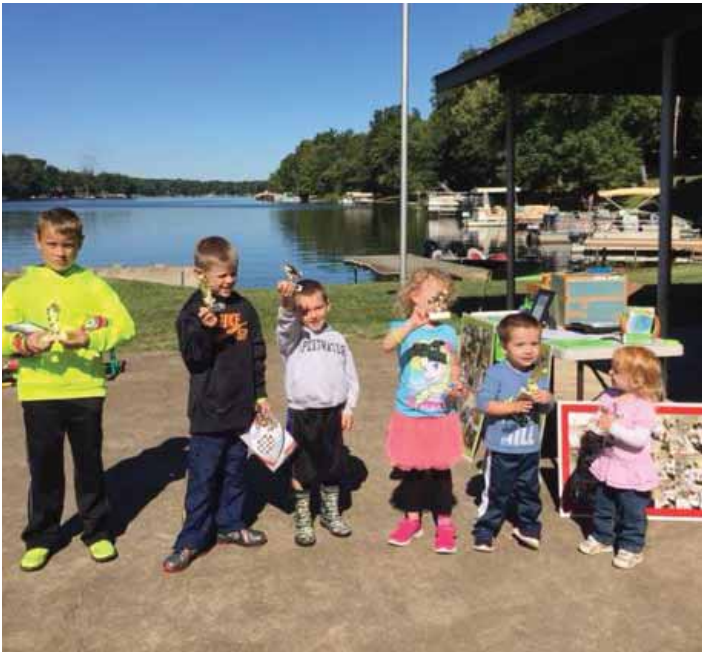
First and second place winners of the fishing tournament.