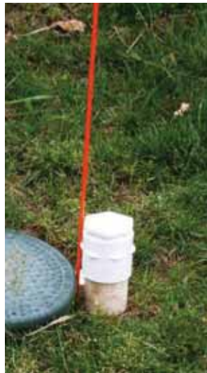
Sewer cleanout pipe with 4-ft marker stake.

Please be careful in cutting grass and when driving and parking along the edge of the road. And remember to contact Missouri One-Call System when you have a project that requires digging. Placing a locate request is free and easy! Call 1-800-DIG-RITE (800-344-7483) or 811 or place your request online at http://www.mo1call.com .