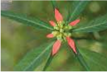
Euphorbia heterophylla is a wild poinsettia native to Missouri. We spotted a few individual plants like this along S Lakeshore Dr last year.

PRSR STD US POSTAGE PAID HILLSBORO MO PERMIT NO. 9