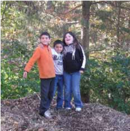
Bulb planters. See page 4.

PRSR STD US POSTAGE PAID HILLSBORO MO PERMIT NO. 9