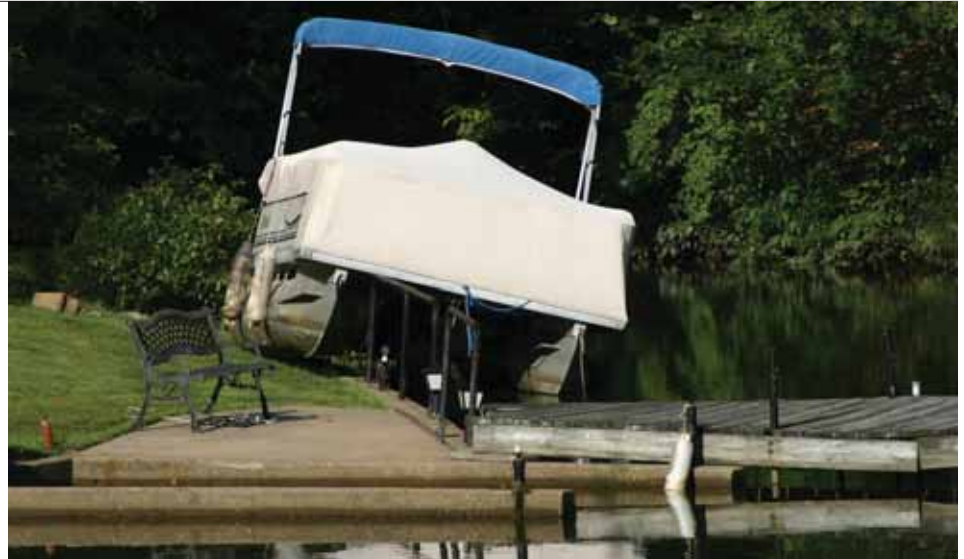
In the great flood of September 14, 2008 we received a record 4.5 inches of rain in 3 hours. This boat rose with the water level and was left hanging on a 3-foot railing along the seawall. More pictures on page 11.