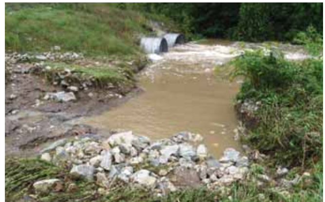
Above: Water poured over the road near the south side bridge and scoured a large hole along the north bank of the inlet stream.

The lakefront and inlet stream areas suffered flooding and erosion.. The check dam and silt basins did prevent a lot of silt from entering the lake. The silt basins had to be dug out, inlet stream repaired, and blocks at the beach area had to be reset.