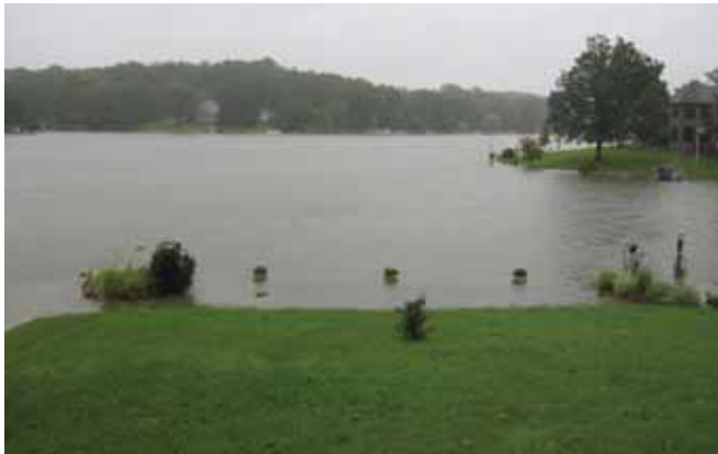
Above: Water rose quickly and passed the gardens and planters along the seawall at F29. Below: the newly placed sand and gravel at the lakefront beach was washed away.