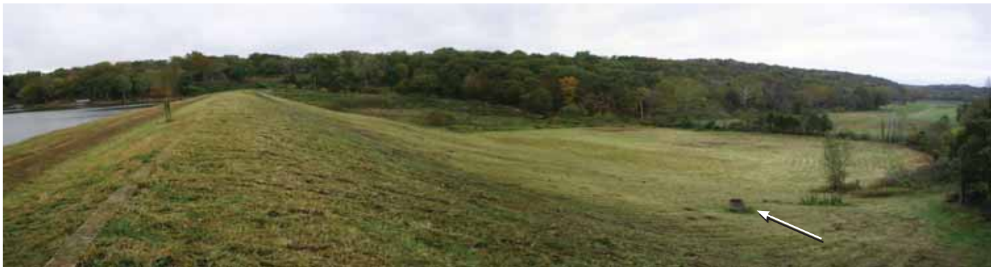
Back of the dam from the north side, Oct 11, 2006. The grass and weeds have been cut. The seepage collector is visible on the right (arrow).