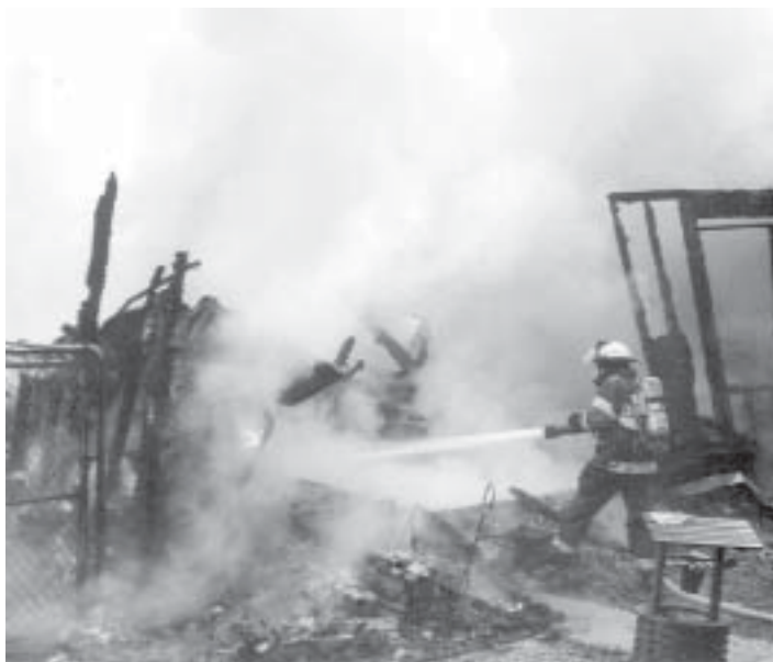
Firefighters battle the flames and smoke at the Farwig house Sept 4. The house was destroyed, fortunately there were no injuries.

Anyone interested in an additional information resource for eliminating residential fire deaths, or other timely hints regarding fire prevention, visit FireSafety.gov or fireplans.com on the internet.