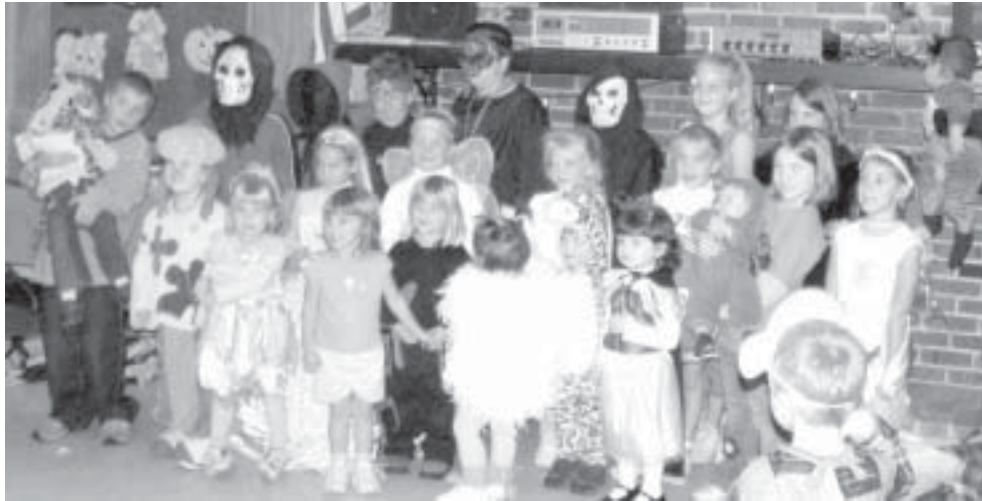
Biggest and best dressed crowd at the Kid's Halloween Party.