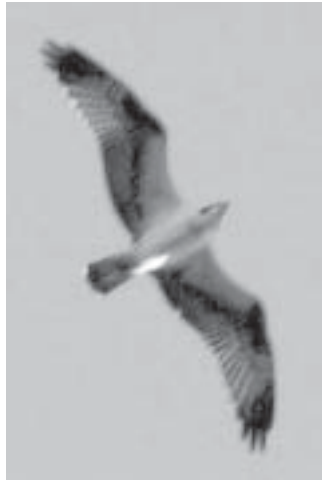
Osprey over Lake Tish Oct 15.