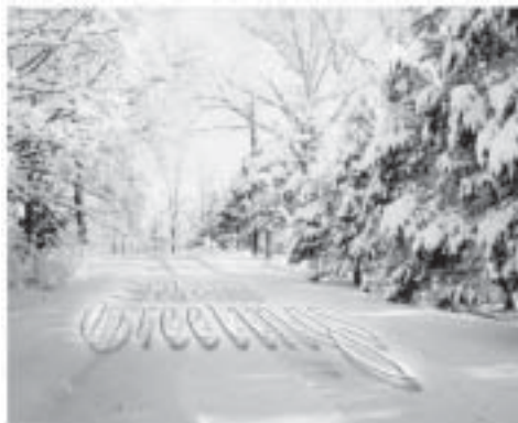
Holiday greeting cards with color photos of and greetings from Lake Tishomingo. $10 per pack of 12 cards. Contact Dixie Bryant 285-6043.