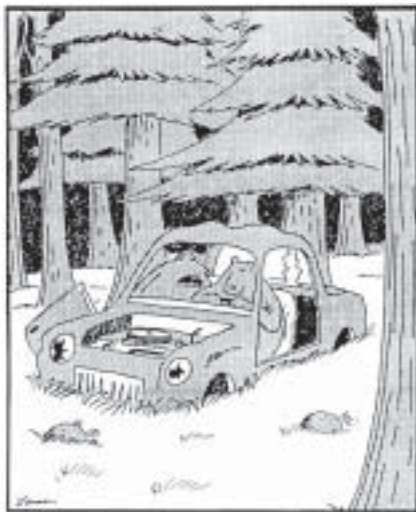
"Think about it, Mandy... if we could get this baby rummin', we could run over hikers, pick up females, chase down male deer -- man, we'd be the grizzlies from hell!"