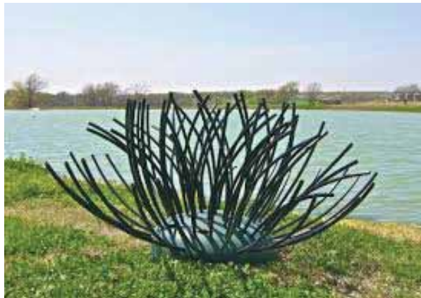
Pond King fish habitat artificial structure.

Thus never being exposed when lake is brought down.