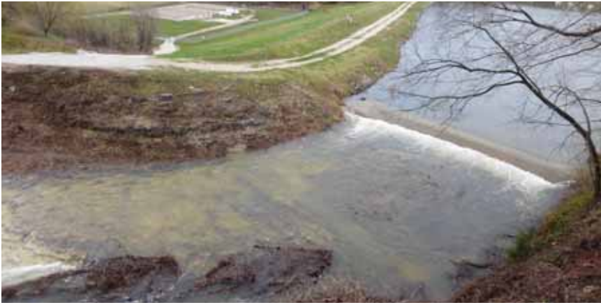
Water flowing vigorously over the spillway as a result of the heavy rains April 7, 2015.