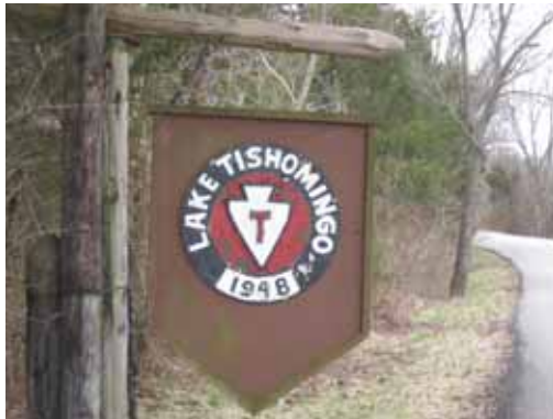
Original sign at the entrance. It is now awaiting repainting.

Some information appearing in the June 1953 issue