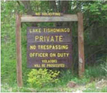
Newly repainted sign at entrance. Thanks to the Lakeside Gardeners.

PRSR STD US POSTAGE PAID HILLSBORO MO PERMIT NO. 9