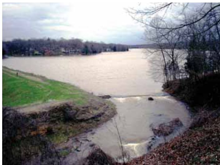
March 17 to April 10, 2008 we received 13.4 inches of rain. On average we only receive about 3 inches of rain in March.