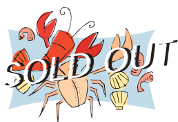
Crawfish Boil Apr 26