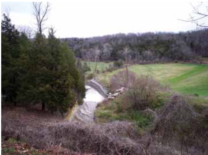
April 10, 2008. After another 2.5 inches of rain, water pours over and cascades down the spillway heading for Belew Creek.