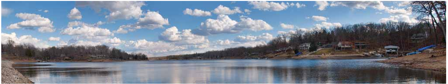
Lake Tishomingo, February 2008.