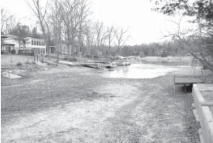
Cove G-H, before