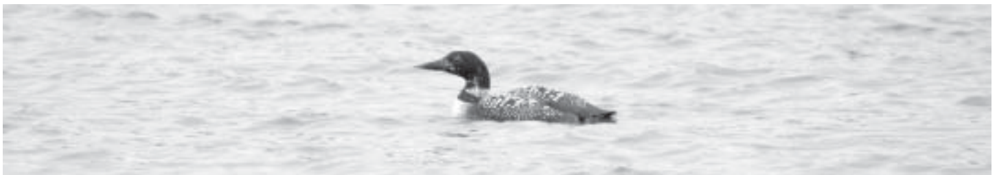
March 28 - 29 seven or more loons visited the lake.