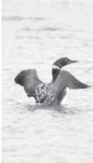
Loon viewed from F-29 on March 28. See another photo on page 9.