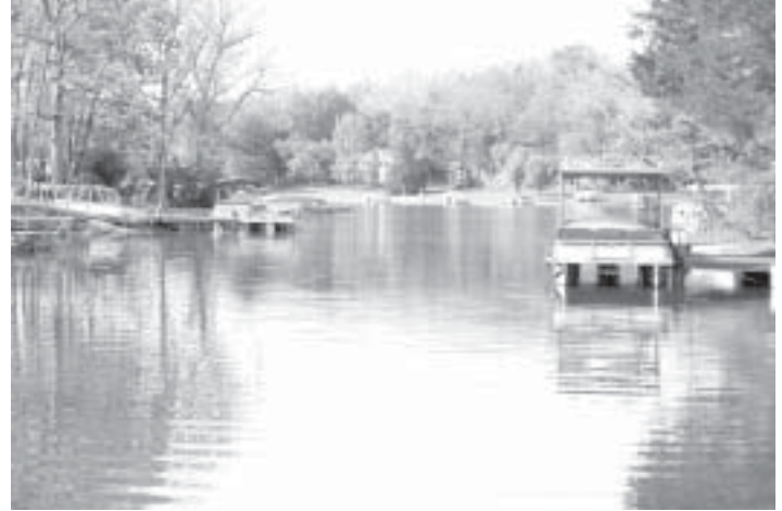
Cove G-H, after