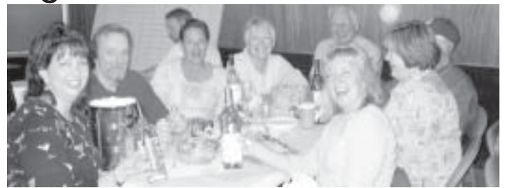
Team Lents, defending champs of 2005, did not win.