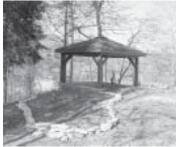
The wellhouse (above) has been repaired and painted and the adjacent area is being restored to a wildflower garden. And the new garden in front of the sales office (below) is filled with bright yellow daffodils.