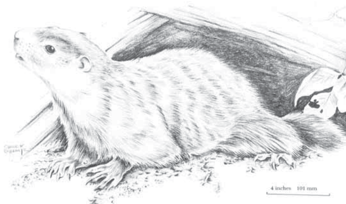
Woodchuck, Marmota monax, A.K.A Groundhog.