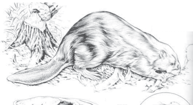
Beaver, Castor canadensis