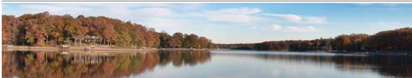
Lake Tishomingo, November 2007.