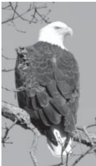
Bald Eagle perched in a tree at G-12 January 7, 2006.