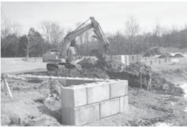
First day of building, February 10, 2006.