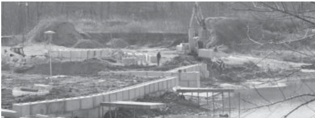
February 15, 2006.