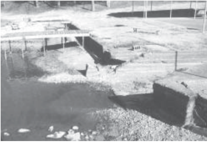
Boat ramp and seawall January 10, 2006.