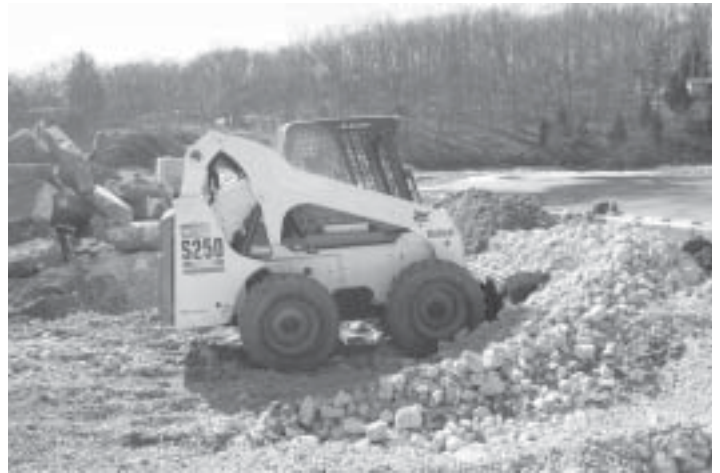
February 14, 2006.