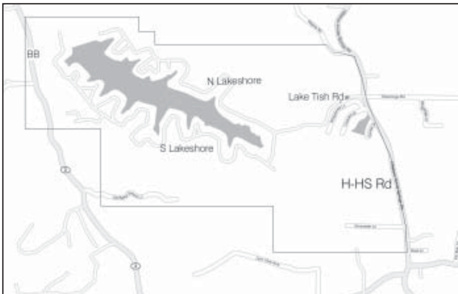
Proposed Tishomingo Water Sewer District #13 inside the marked boundaries -- Hillsboro-House Springs Rd on the east and Hwy BB on the west.

A: No. According to our engineer, the main sewer lines will be laid alongside the roads. And modern construction techniques allow laying pipe under existing roads and driveways without damaging them.