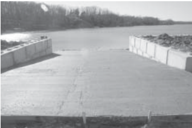
New concrete boat ramp, February 14, 2006.