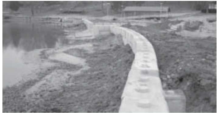
February 15, 2006.