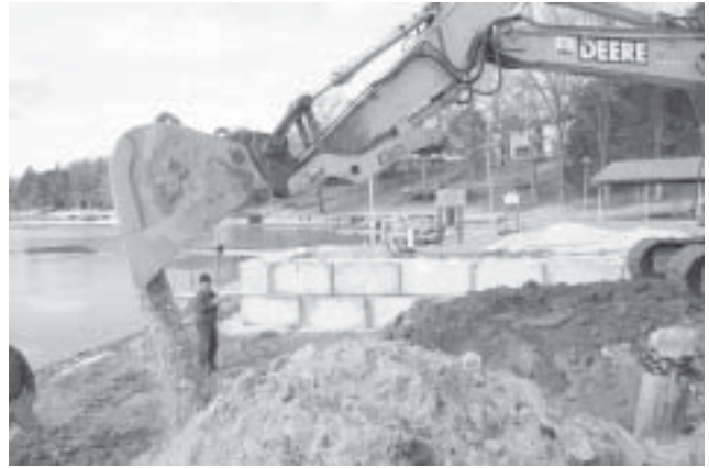
First day of building, February 10, 2006.