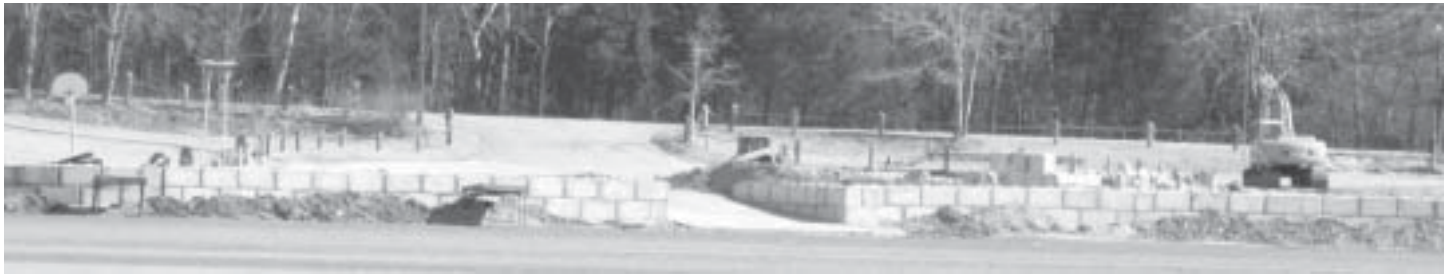
New boat ramp and seawall, Feb 18, 2006. More pictures on page 19.