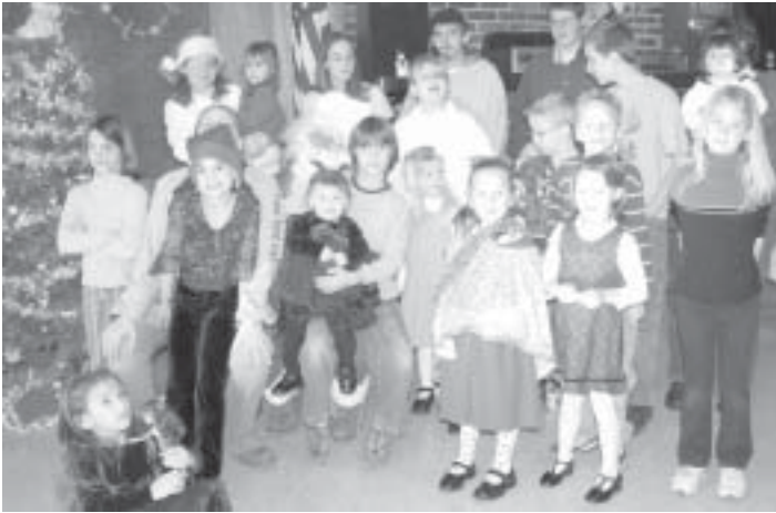
Children's Christmas Party with Santa.