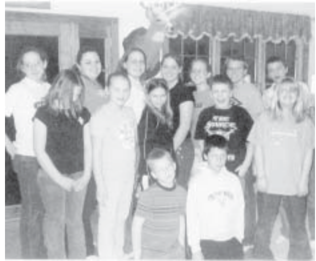
Teen's Pizza Party.