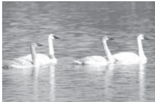
Two adults and two cygnets cruise the lake.

The yellow collar indicates a swan banded by the Wisconsin restoration program. Winter sightings of Trumpeters are very helpful since it is difficult to get them to migrate to safe wintering places where open water and food are available (aquatic vegetation is their natural food, but many swans now have adapted to field feeding where they thrive on leftover corn and wheat, even carrots and potatoes). Many of the Trumpeters breeding in Minnesota and Wisconsin stay north on the larger rivers that are kept open by power plants. However, some do venture south and have been reported over the years from your area. Riverlands Environmental Area, just north of St. Louis, has had wintering