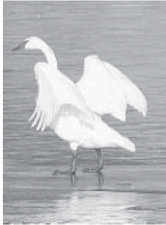
Dec 26, 2004 Trumpeter swans visited Lake Tishomingo. See story on page 7.