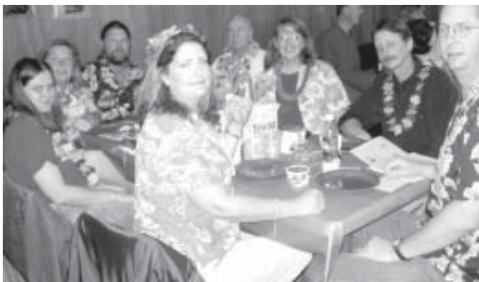
Trivia Night: Team Kimmel/Bryant. They didn't win but they were the best - dressed participants.