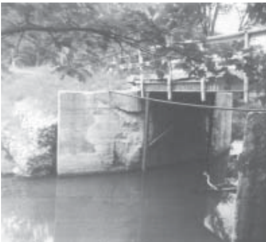
Photo of southside bridge from 1993. CRD Campbell Engineering comments: View of the north abutment. Note the poor condition of the concrete-much has spalled away and very little reinforcement is evident. Bridge superstructure is supported on the steel piles. Viewed looking northeast.

7784 Meadow Dr. - 7706 Mohawk Trail - 6139 S. Lakeshore Dr. - 6482 S. Lakeshore Dr. 6308 N. Lakeshore Dr. - 7840 Mohawk Trail - 7813 Mohawk Trail - 6479 N. Lakeshore Dr. 7664 Fairview Dr. - 7744 Mohawk Trail - 7688 Lakeview Dr. - 6435 S. Lakeshore Dr. 6751 S. Lakeshore Dr. - 6072 S. Lakeshore Dr. - 6142 S. Lakeshore Dr. - 7736 Fairview Dr. 5783 S. Lakeshore Dr. - 5929 S. Lakeshore Dr. - 6081 N. Lakeshore Dr. - 5933 S. Lakeshore Dr. - 5700 S. Lakeshore Dr. - 7228 Meadow Dr. - 7768 Meadow Dr. - 6223 S. Lakeshore Dr. - 5722 N. Lakeshore Dr. - 7671 Lakeview Dr. - 6472 N. Lakeshore Dr. - 7668 Lakeview Dr. - 5693 Lake Tishomingo Rd - 6367 S. Lakeshore Dr. - 7828 Mohawk Trail - 6208 N. Lakeshore Dr. - 6541 S. Lakeshore Dr. - 7784 Mohawk Trail - 6140 S. Lakeshore Dr. - 6355 S. Lakeshore Dr. - 5730 N. Lakeshore Dr. - 6786 S. Lakeshore Dr. - 7816 Mohawk Trail - 6178 S. Lakeshore Dr. - 5925 N. Lakeshore Dr. 6016 N. Lakeshore Dr. - 6018 N. Lakeshore Dr. - 6089 S. Lakeshore Dr. - 7716 Meadow Dr. - 6709 S. Lakeshore Dr. & Lots & Lots of Lots