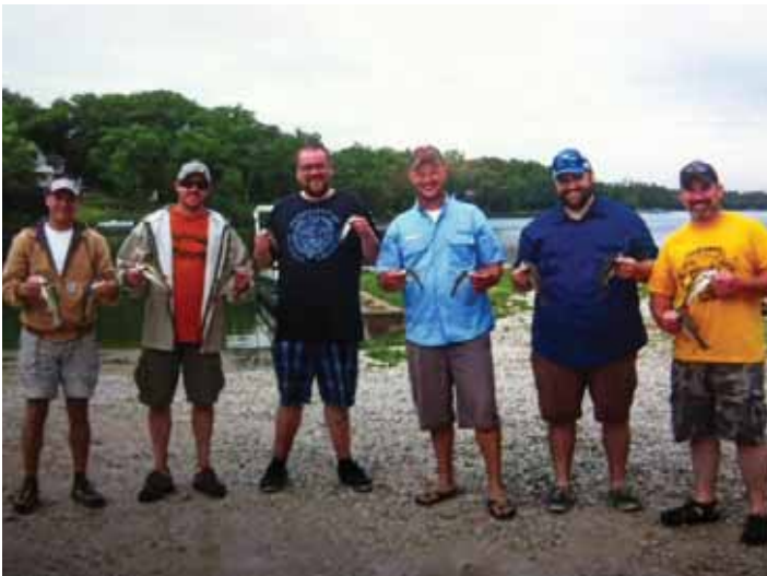
About one-third of the participants stayed around to help clean fish.