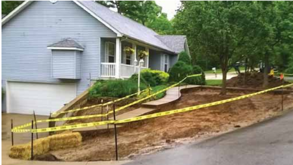
The EPA began testing for lead in the soil at Raintree in 2008. They are still digging up landscapes and remediating them. It is not pretty and may cause the trees to die..

After reviewing all of this information, the LTPOA board has reversed its initial vote of allowing the EPA and its contractors access to Lake Tishomingo.