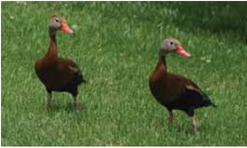
Black-bellied whistling ducks at Lake Tish June 15. More info on page 2.

PRSR STD US POSTAGE PAID HILLSBORO MO PERMIT NO. 9