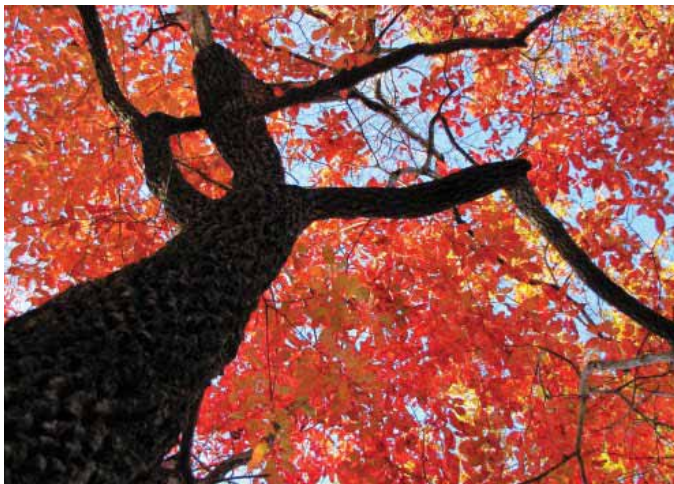
Nyssa sylvatica, the native Missouri Black Gum tree.