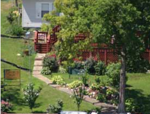
July 2012 Garden of the Month: Niemeyer, A35.

PRSR STD US POSTAGE PAID HILLSBORO MO PERMIT NO. 9