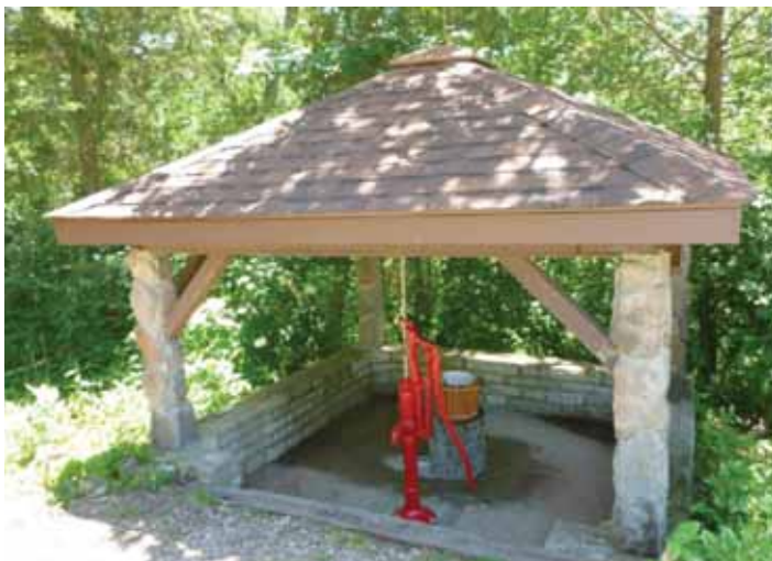
Pump house recently remodeled by the Lakeside Gardeners.

Next Newsletter Deadline: August 20, 2012