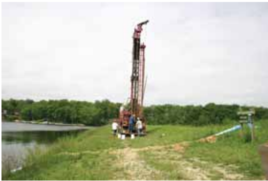
Drilling exploratory holes.

tion to the leak (there was a discoloration of the leak water at some point during the drilling), but these holes consumed only a small fraction of the water that holes 3 - 5 did. That meant that those holes were probably minor contributors to the leak. DT said he thought that holes 3 - 5 supplied about 90% of the water to the leak.