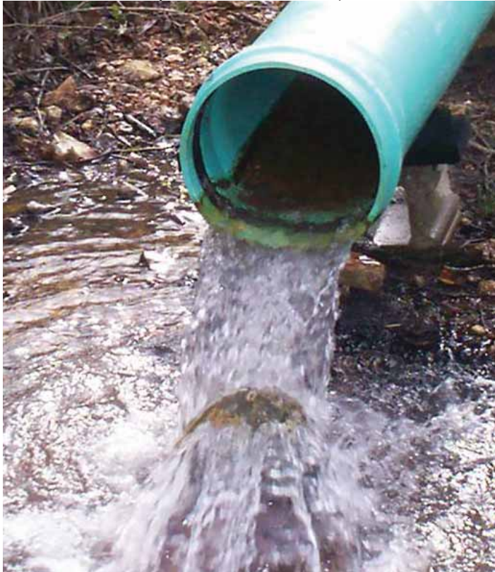
Water flow from leak collector, 300 gal/min, January 2008.