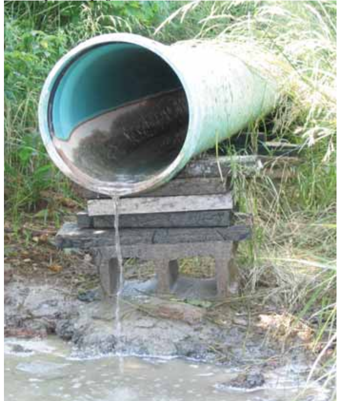
Water flow from leak collector, 0.6 gal/min, June 2008.