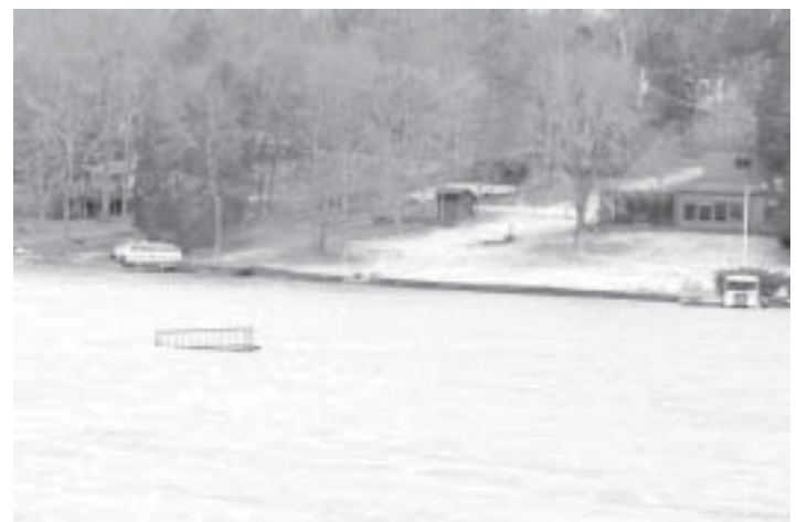
Spotted traveling eastward last March, this dock came to rest near N-21. It was subsequently rescued and returned to its normal position.