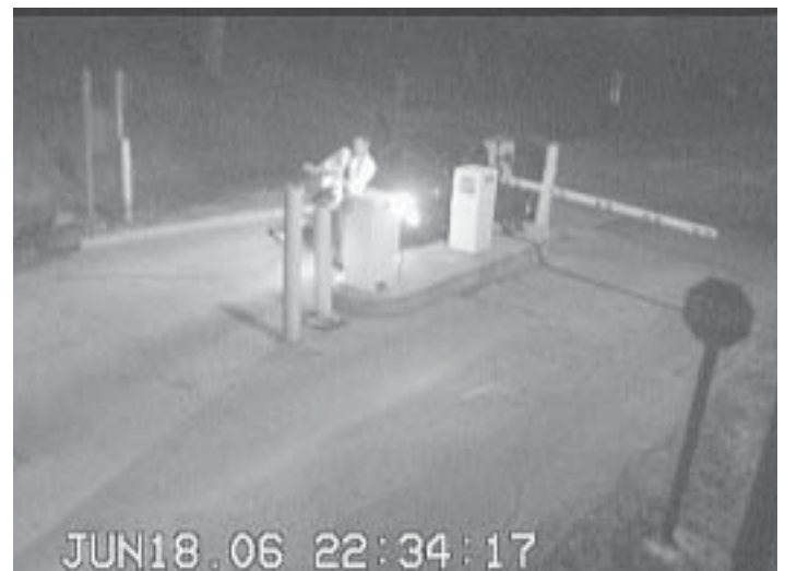
Caught in the act . . . recent gate break. We have license plate number and will track him down.