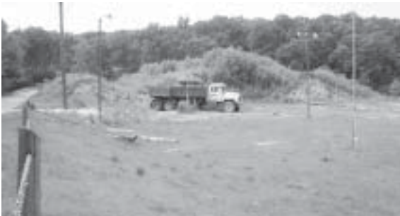
Last view of the mountain of silt.

PRSR STD US POSTAGE PAID HILLSBORO MO PERMIT NO. 9