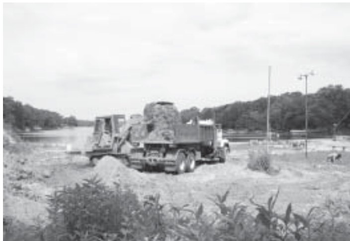
Removal of the mountain of silt from the lakefront.