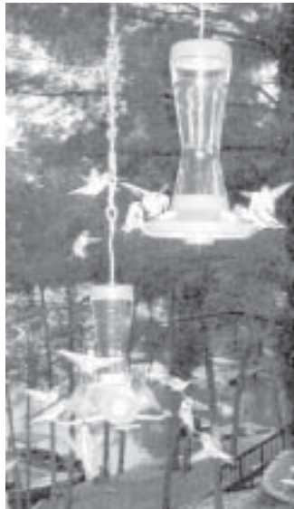
Fourteen hummingbirds viewed from A-14 in late May.