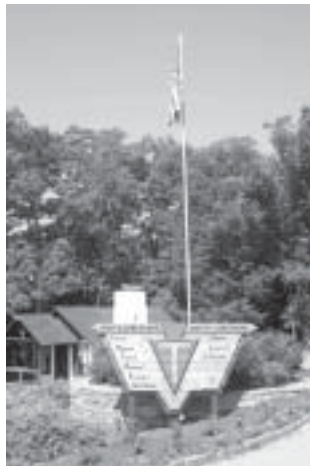
New entrance sign and landscaping donated and installed by the Lakeside Gardeners.