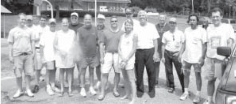
The tournament competitors, after a very good day of fishing.