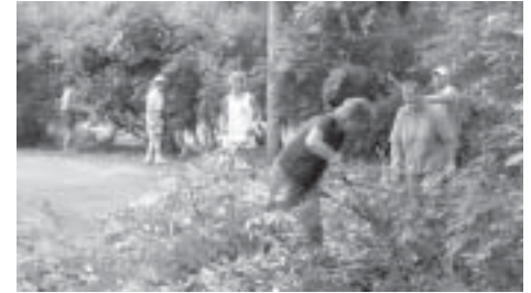
Lakeside Gardeners apply the pruning techniques and gather cut branches.

• Do not top trees. Even if upper branches are damaged in a storm, make repairs by cutting the branch at about a 45-degree angle or along the branch bark ridge. Remove broken tops and