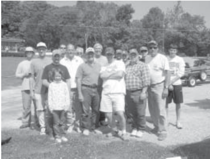
The fishermen -- after a good day on the lake.

The total catch weighed in was 47.7 pounds caught by six of the competing boats. In all, eight boats and 17 individuals participated in the tournament.