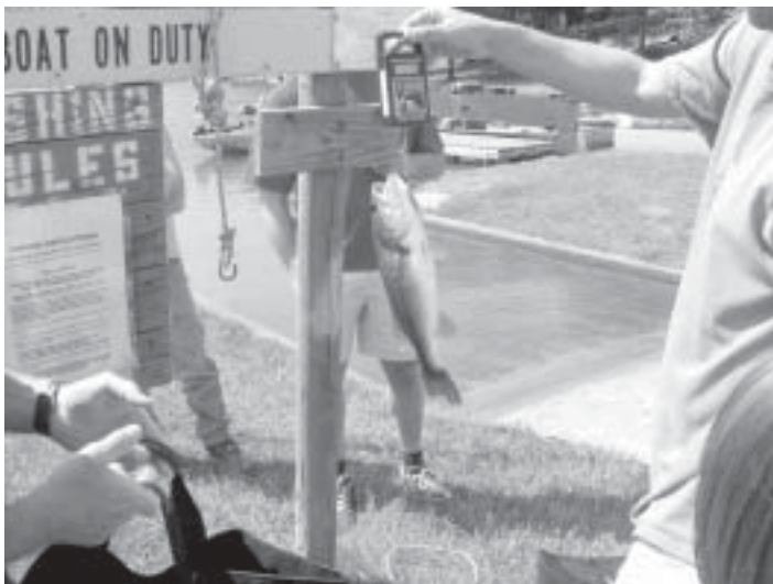
Weigh-in with the digital balance.