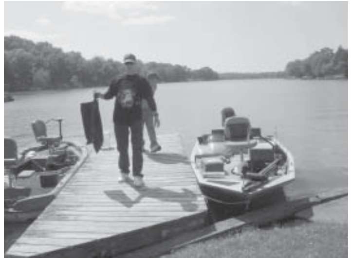
Bringing in the catch.