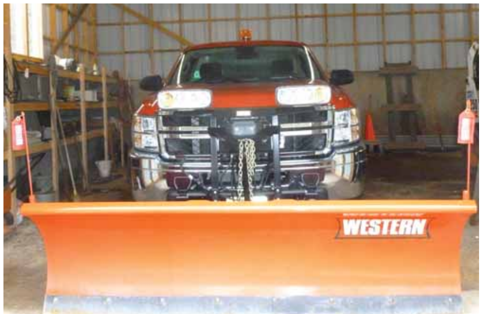
The new truck is a bright red Chevrolet 3500 HD.