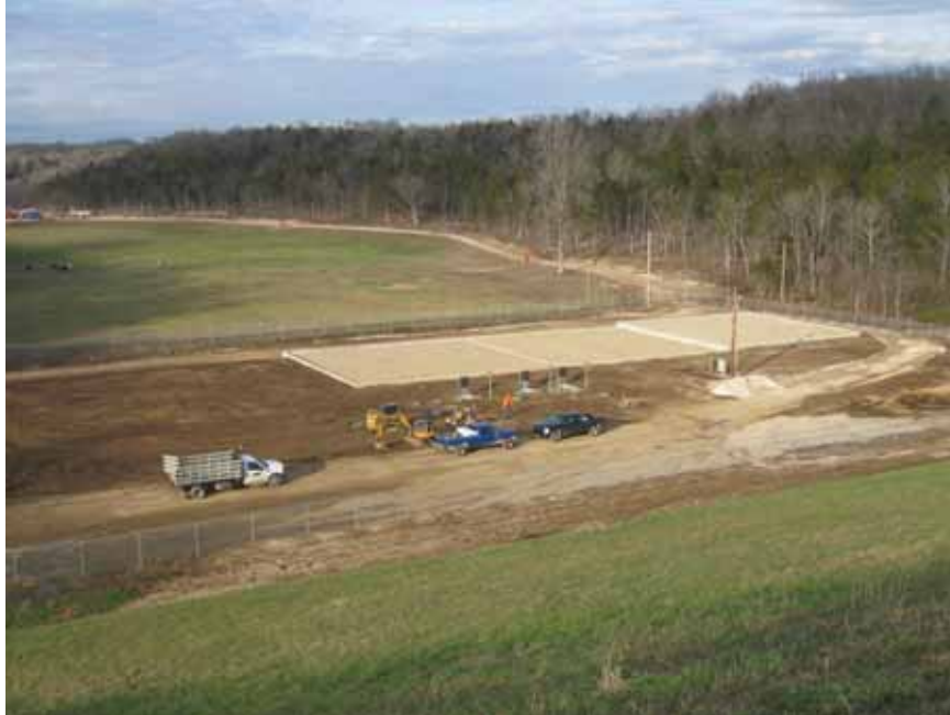
View of the treatment plant from the top of the dam.

There are a few residences that did not provide the certified electrical circuit and their connections between the house and STEP tank will not be paid for by the District. They will still be charged a monthly fee because all the equipment is in place and ready to be connected. They will be forced to connect and when they do they will bear the full cost to be connected.