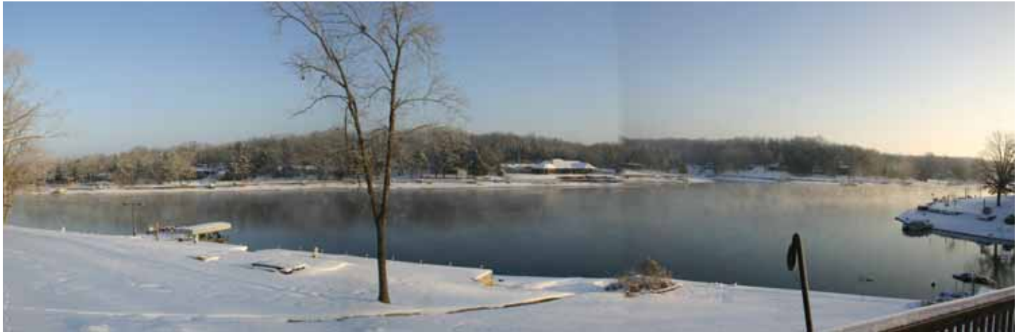
Sunrise December 16 with 6-1/2 inches on snow on the ground.