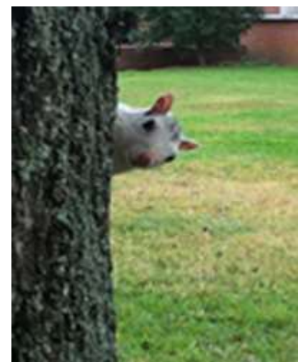
A white squirrel peeks out from behind a tree at Brevard College in Brevard, North Carolina.

In many of the places where white squirrels thrive, their