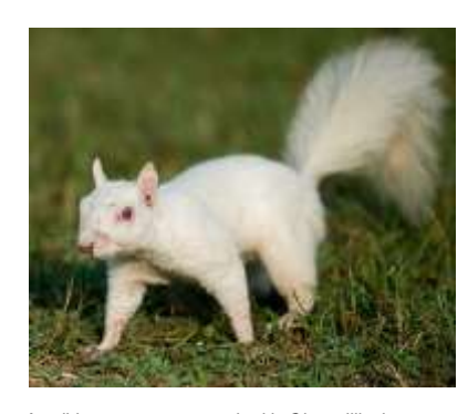
An albino eastern grey squirrel in Olney, Illinois.

Most of the white squirrels seen in North America are genetic color variants of the eastern grey squirrel.