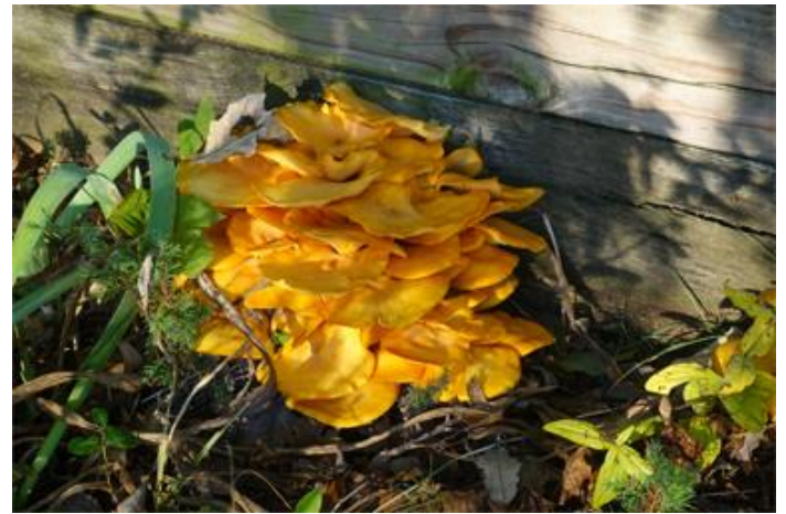
Jack-o'-Lantern Mushrooms

< https://mdc.mo.gov/sites/default/files/2021-03/MushroomGuide.pdf >