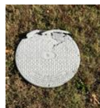
Broken Sewer Lid

In a continued effort to be good stewards of our community resources, the PWSD#13 board would like to remind property owners of a few simple things that can help save all of us money when it comes to upkeep and repair to our sewer district equipment and infrastructure.