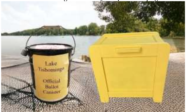
Left: Original black ballot bucket. Right: New ballot box hand crafted by Jon Riche.

LTPOA Annual Meeting continues from previous page