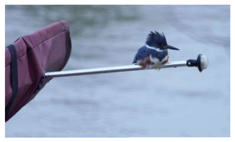
Belted Kingfisher