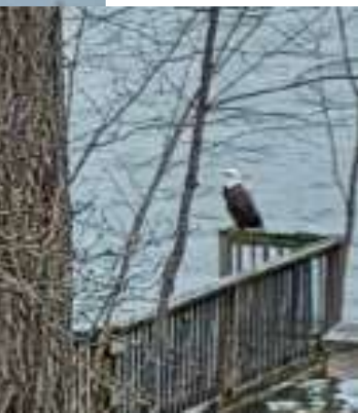
Bald Eagle