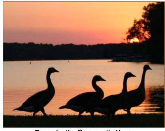
Geese by the Community House