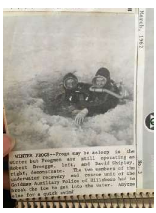
Newspaper clipping from Droege family scrapbook. Original source unknown.

The Droege family still own property here and are active participants in community activities.