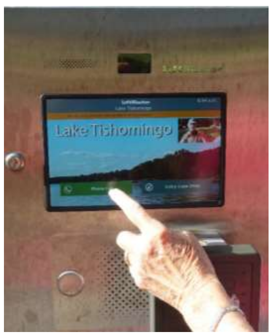
New CAPXLV gate entry system