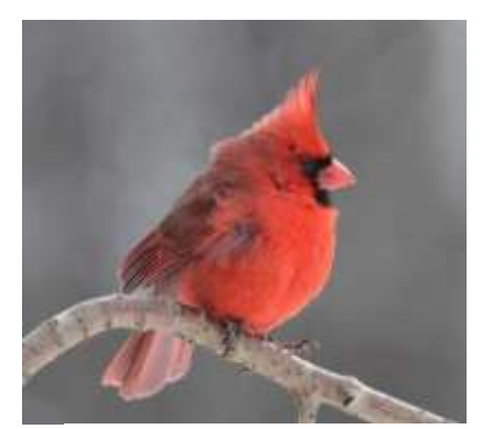
Male Northern Red Cardinal photo in public domain

• The songbird syrinx, or the bird voice box, makes vocal gymnastics possible. The Northern Cardinal is able to sweep through more notes than are on a piano keyboard in just a tenth