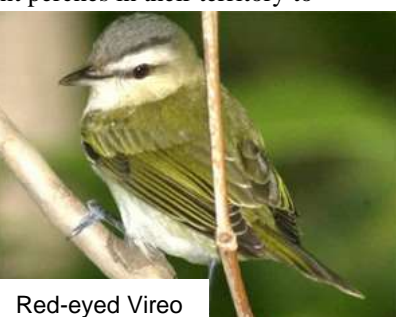
Missouri Department of Conservation

Singing peaks during spring when birds pair off and claim territories. There is great variety among bird songs, from the red-winged blackbird's trill to the robin's melodious warbling. Even the